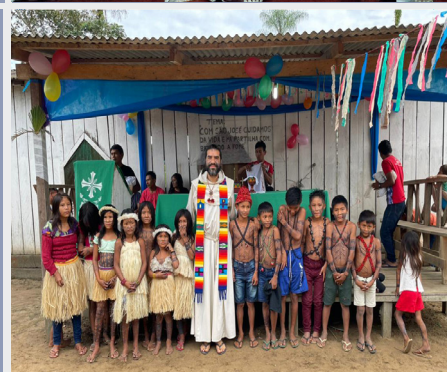
St Francis Mission in Rio Cururu, St Benedict Custody, Amazon