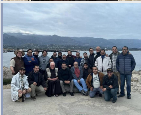
Meeting of the "under 10" friars, from the St. Junipero Serra Province, Mexico, in California (USA)