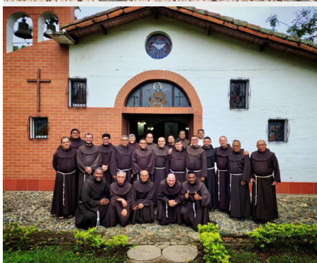
Annual Spiritual Retreat in Colombia