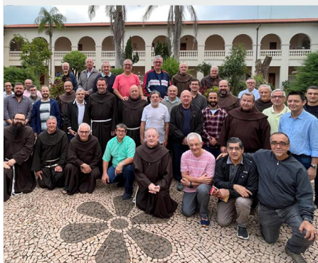
Meeting of Guardians of the Immaculate Conception Province, Brazil