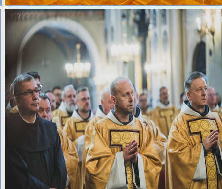
Confirmation in the San Francisco de Asís Parish of Mostazal, Chile