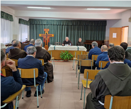
Formation meeting in Leiria, Portugal