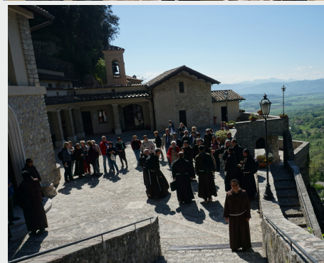
Ongoing formation of the fraternity of the General Curia at Greccio, Italy