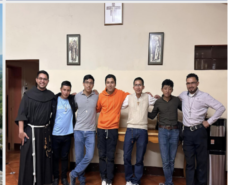
Meeting of aspirants in Guatemala