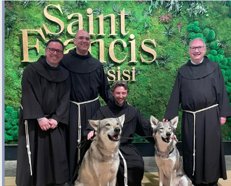
Inauguration of the art exhibition on St Francis of Assisi in the National Gallery, London, United Kingdom