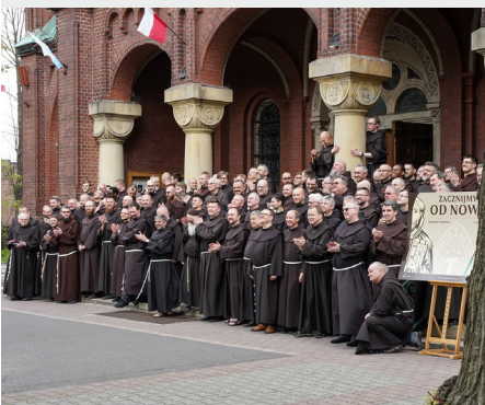
Chapter of Mats in the Province of the Assumption of the Blessed Virgin Mary, Poland