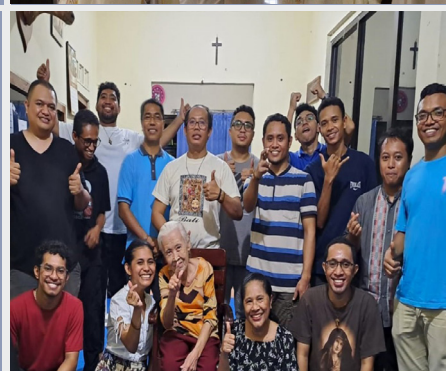
"Gardianat Assisi" from Indonesia visits the "St. Antonius Padua" in Jakarta