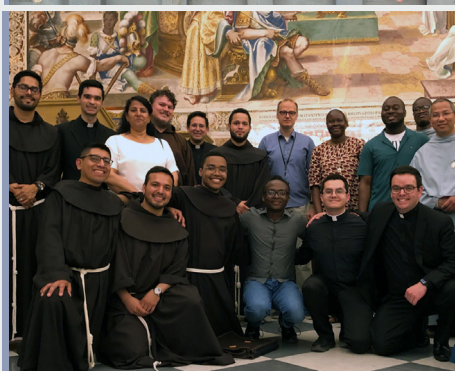
Students of the Pontifical Antonianum University visit the Vatican Apostolic Library