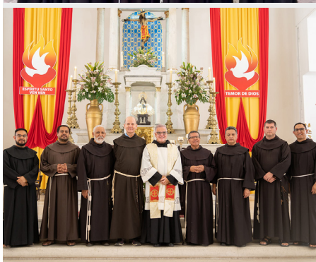
New Definitory of the Province of San Francisco and Santiago de México