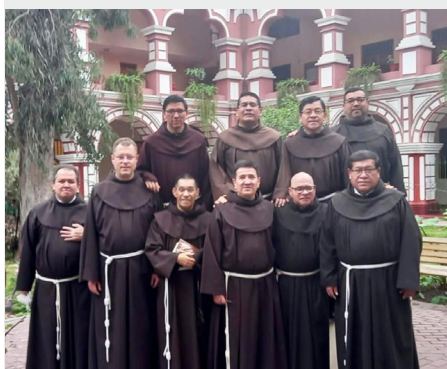
Meeting of the Ministers of the Bolivarian Conference in Peru