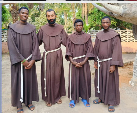
Novice retreat in preparation for first profession, Angola