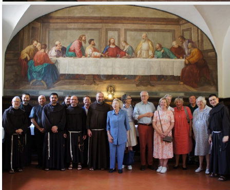
Visit by HRH Beatrice of Holland, Queen Mother to La Verna