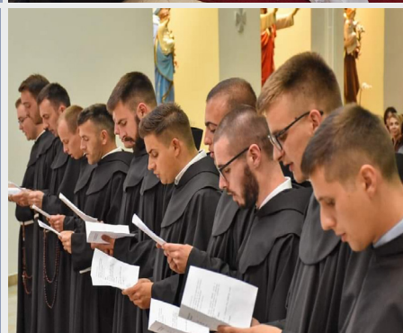
First professions in Croatia