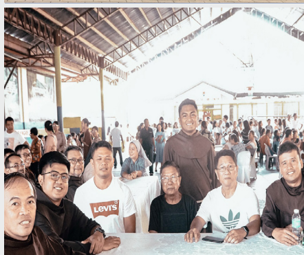
New Franciscan mission in Tondod – St Joseph (Philippines)