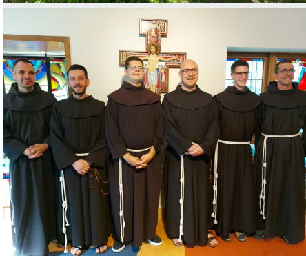
Entry of novices to the International Novitiate at Killarney (Ireland)