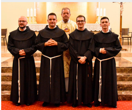
Solemn professions in the province del SS. Redentore (Spalato, Croazia)