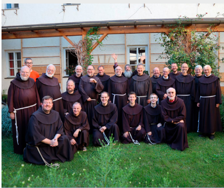
Chapter of the Custody of Christ the King (Switzerland)