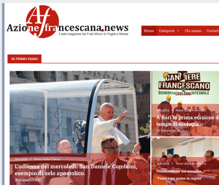
New website of the Province of Friars Minor of Puglia and Molise (Italy)