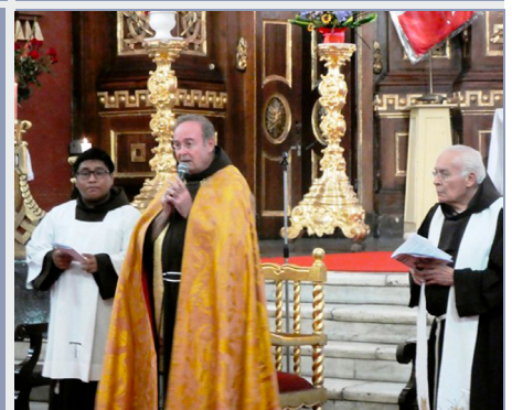
Solemn Mass for the 800th anniversary of the Greccio Christmas in Lima (Peru)

have trained and have opted for ecological and land care projects, others who through their professions have chosen to be at the service of people with addiction problems in marginal neighbourhoods; other young people accompany vulnerable families, or have taken action to create spaces of welcome and care for victims of violence, gender violence and for the rights and lives of children.