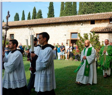
"Festa del Canticco" in San Damiano, Assisi (Italy)