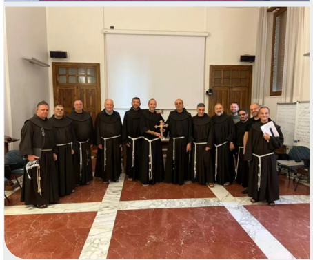
Relic of from the Holy Mountain of La Verna sent to Kiev (Ukraine) for peace