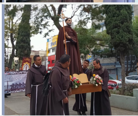
Celebrations invoking peace for the New Year in Jerusalem (Custody of the Holy Land)