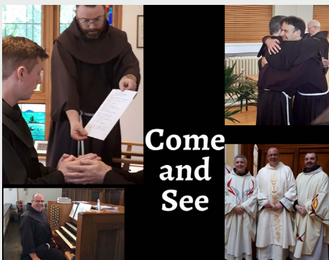
"Come and See Weekend" in February 2024 (Province of Ireland)