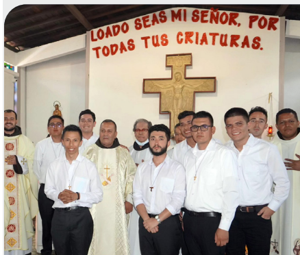
Entry of postulants into the Province of the Holy Faith (Colombia)