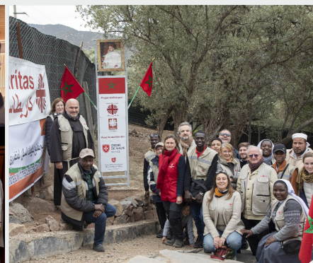
The Franciscan friars of Marrakech inaugurated the first "Caritas Intermediate Accommodation Village" (Morocco)