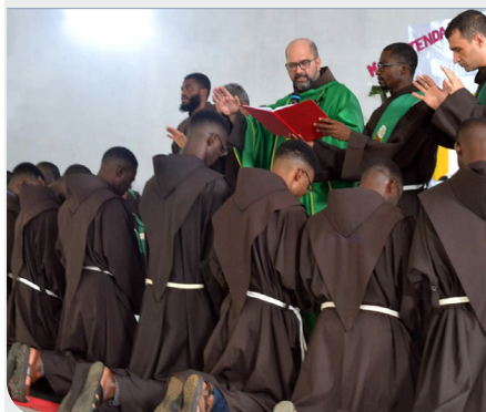
Solemn Professions in the Foundation of the Immaculate Mother of God (Angola)