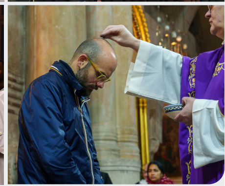
Priestly and Diaconal Ordinations in Ecuador (Province of St. Francis of Quito)