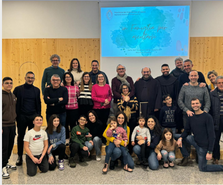
Family pastoral meeting, Province of the Assumption of the BVM (Italy)