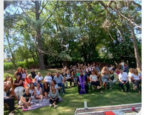
Meeting of the Educational Communities of the Province St. Francis Solano (Argentina)