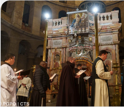
Second Vigil for Lent in the Holy Sepulchre (Custody of the Holy Land)