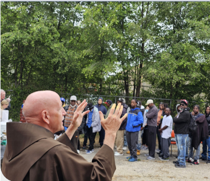
Franciscan Outreach, Prov. Our Lady of Guadalupe (USA)