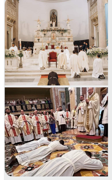
Diaconal Ordinations in the Province of the Most Holy Name of Jesus (Italy)

Franciscans International Workshop on Human Rights in Madagascar