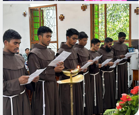
First Professions, Prov. St. Thomas the Apostle (India).