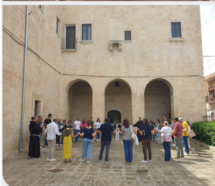
Meeting of Franciscan Families, Prov. Assumption of BVM (Italy).