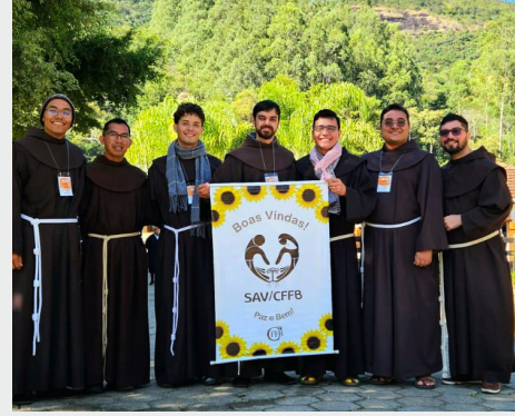
National meeting of formators of the Franciscan Family Conference (Brazil).