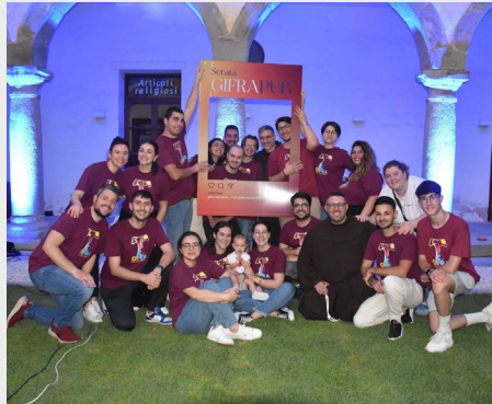
Evening "Gifra Pub" (Sicily)