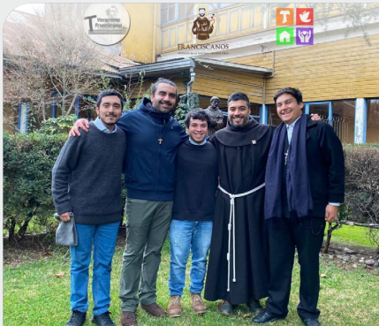
Franciscan Vocation Day (Chile)