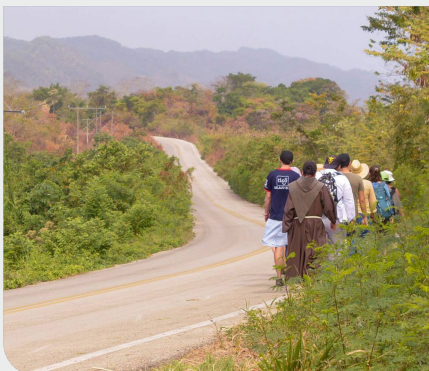
World Refugee Day 2024 (Asia e Africa)