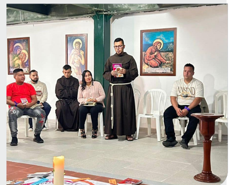
Provincial Meeting of Catechesis, Prov. St Paul the Apostle (Colombia)