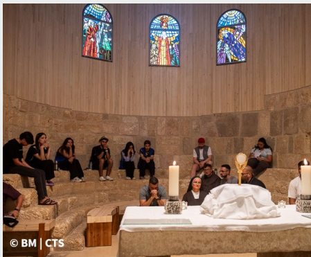
10th Franciscan March in Jordan on Mount Nebo (Holy Land)