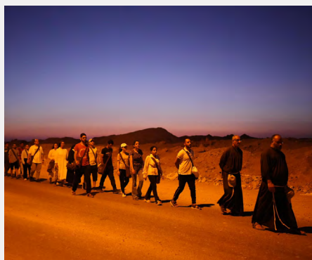
Franciscan March in Egypt, Prov. of the Holy Family