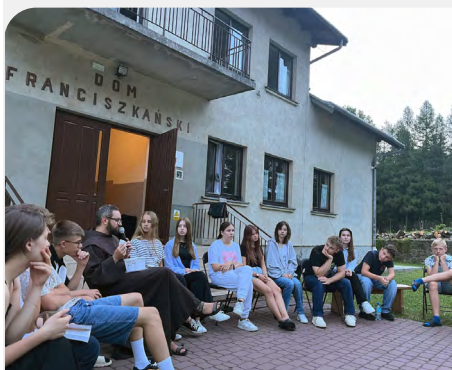
Retreat with 29 young people in Dukla, Prov. Immaculate Conception (Poland)