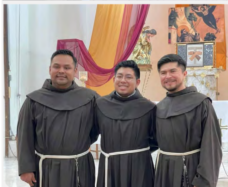
Closing of the canonical month, Prov. St. Philip and St James (Mexico)