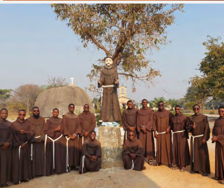
First Profession of the Novices of the Foundation of the Immaculate Mother of God (Angola)