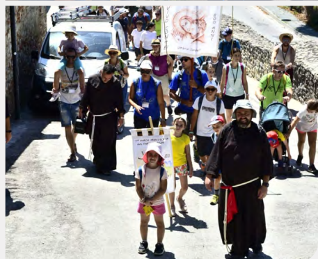
Franciscan March of Families, Seraphic Province of St. Francis of Assisi (Italy)