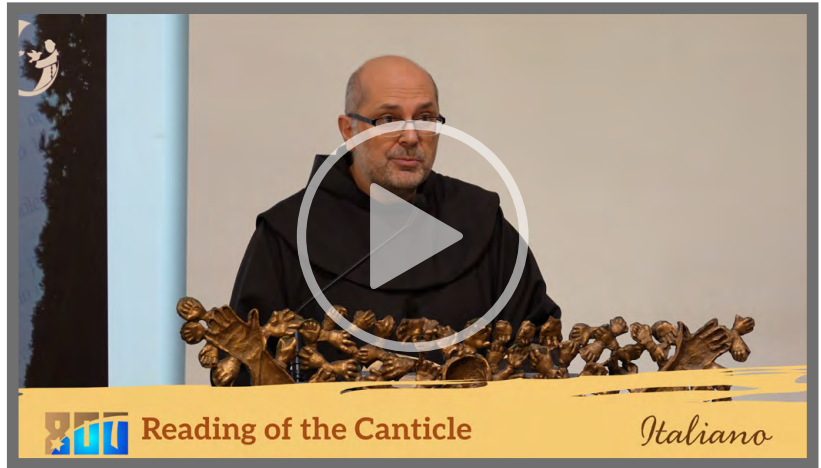
Reading the Canticum of the Creatures – Italiano